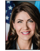
Governor Kristi Noem