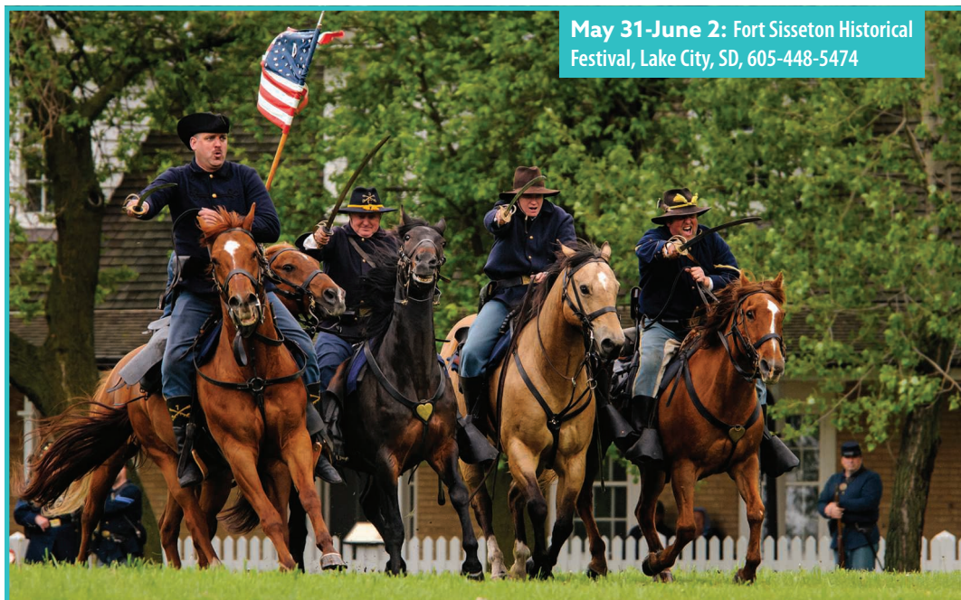
May 31-June 2: Fort Sisseton Historical Festival, Lake City, SD, 605-448-5474