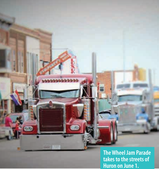
The Wheel Jam Parade takes to the streets of Huron on June 1.

Sunday, June 2 • Registration: 9 a.m. to noon • Show from noon to 4 p.m. • Family Living Center