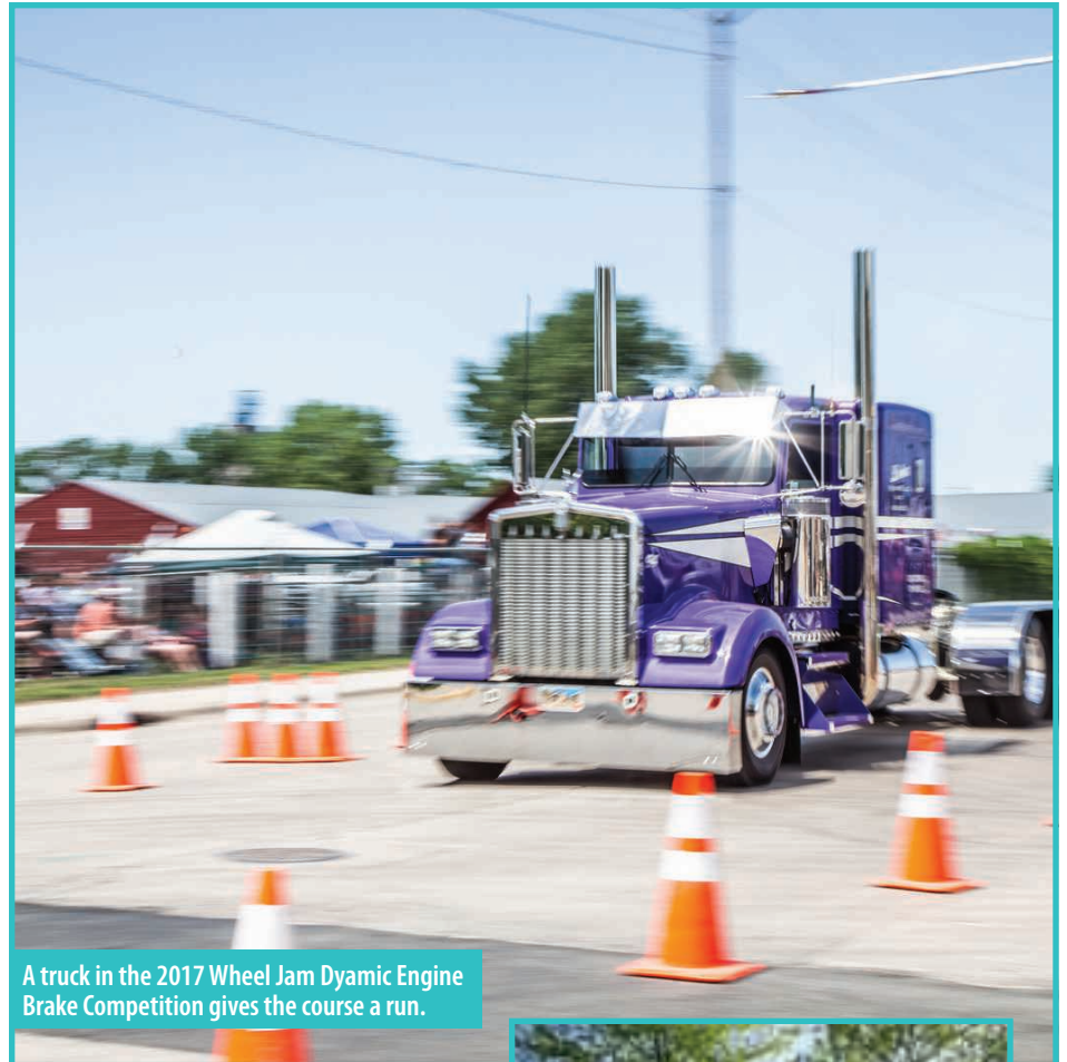
A truck in the 2017 Wheel Jam Dynamic Engine Brake Competition gives the course a run.

Between the concurrent shows for big rigs, cars and pickups and motorcycles, visitors to Wheel Jam will see thousands of gleaming wheels. They can also watch (or be in) the BIG RIGS run in the Dynamic Engine Brake Competition, listen to