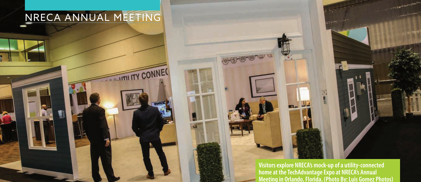
Visitors explore NRECA's mock-up of a utility-connected home at the TechAdvantage Expo at NRECA's Annual Meeting in Orlando, Florida.