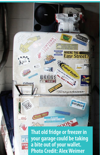
That old fridge or freezer in your garage could be taking a bite out of your wallet.