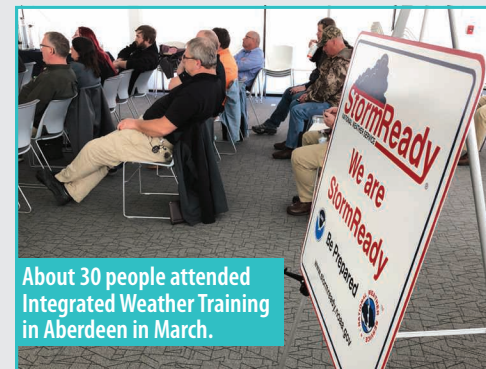
About 30 people attended Integrated Weather Training in Aberdeen in March.

More than 30 people attended the March 20 workshop.