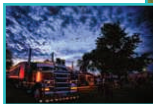
Above: The Wheel Jam Truck Show Light Show illuminates the evening on Saturday. Right: Cars of all types will be on display during Wheel Jam.

Learn more about Wheel Jam at http://www.wheeljam.com/ or by calling the South Dakota State Fair office at 800-529-0900 or 605-353-7340.